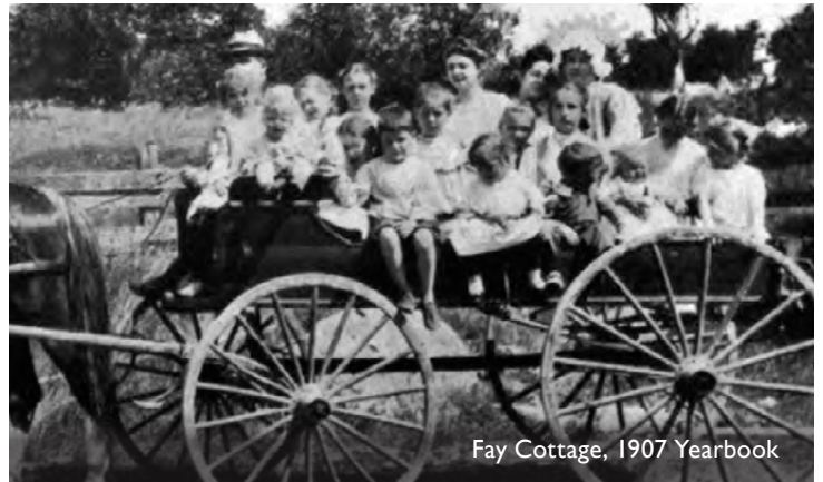
Fay Cottage, 1907 Yearbook