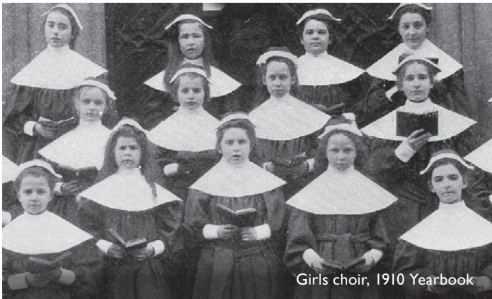
Girls choir, 1910 Yearbook

Book conversation: Tears We Cannot Stop July 2, July 30