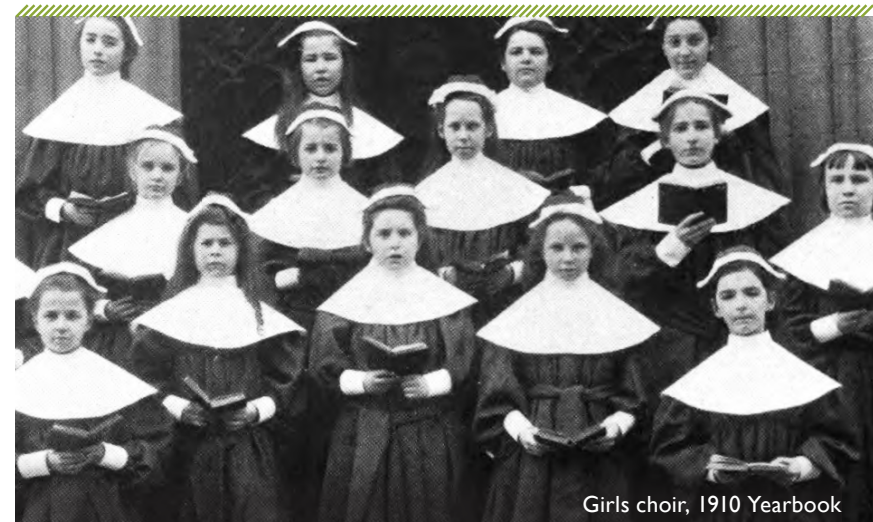
Girls choir, 1910 Yearbook